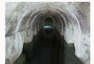
Water supply of Castra Albana