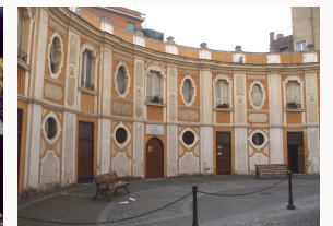
XVII century building